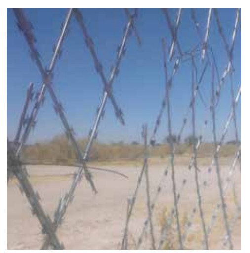
Pictures taken at the scene after the discovery of copper wire theft at the Etunda sub station earlier this month.