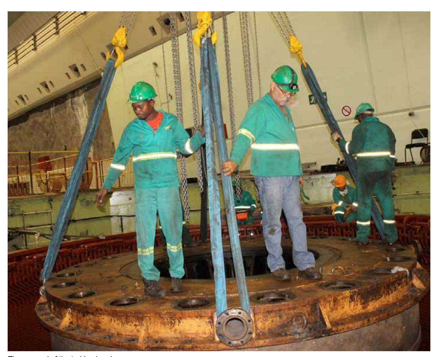
The removal of the turbine head cover.